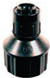
Spectrum™ Thread 1/2"