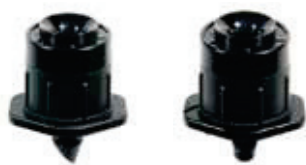
Spectrum™ Barb 4mm