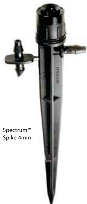
Spectrum™ Spike 4mm